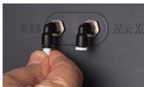
Figure 2 - Gas line 70-803-1105 shown as example