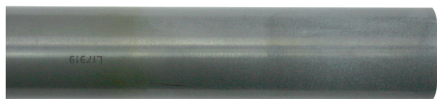
Ceramic outer tube

A combination of high temperature and salt deposit causes a quartz torch to devitrify. Higher concentrations of salt in the samples lead to more rapid devitrification. The quartz torch in the photo was run for only 6 hours with samples containing 10% NaCl and is already badly degraded. By contrast, the ceramic material does not devitrify and is not affected by salt deposits.